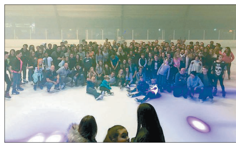
and circled the rink to a soundtrack of music from ranging from 1986,

() SPEED READ: Ice-lovers put on their skating boots for a final session at the Absolutely Ice arena in Montem Lane on Friday, October 28. The rink closed for a 12-month refurbishment on Saturday.