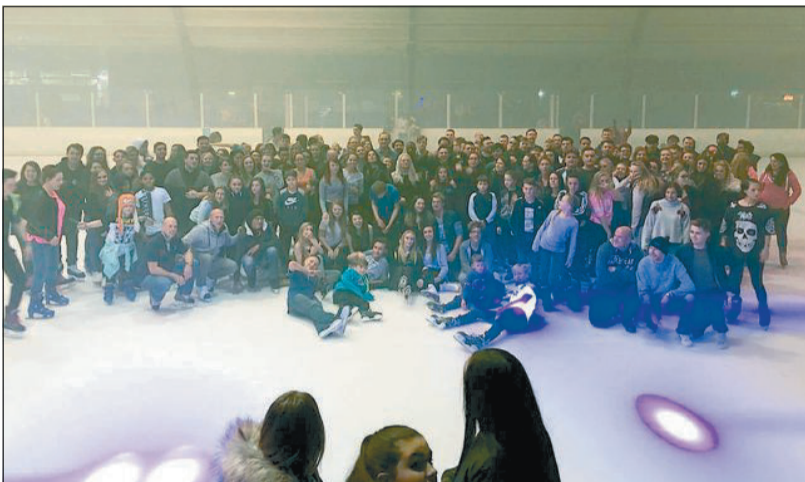
EMOTIONAL GOODBYE: Skaters gather for a group photo at the farewell session to the old ice arena.

SPEED READ: Ice-lovers put on their skating boots for a final session at the Absolutely Ice arena in Montem Lane on Friday, October 28. The rink closed for a 12-month refurbishment on Saturday.